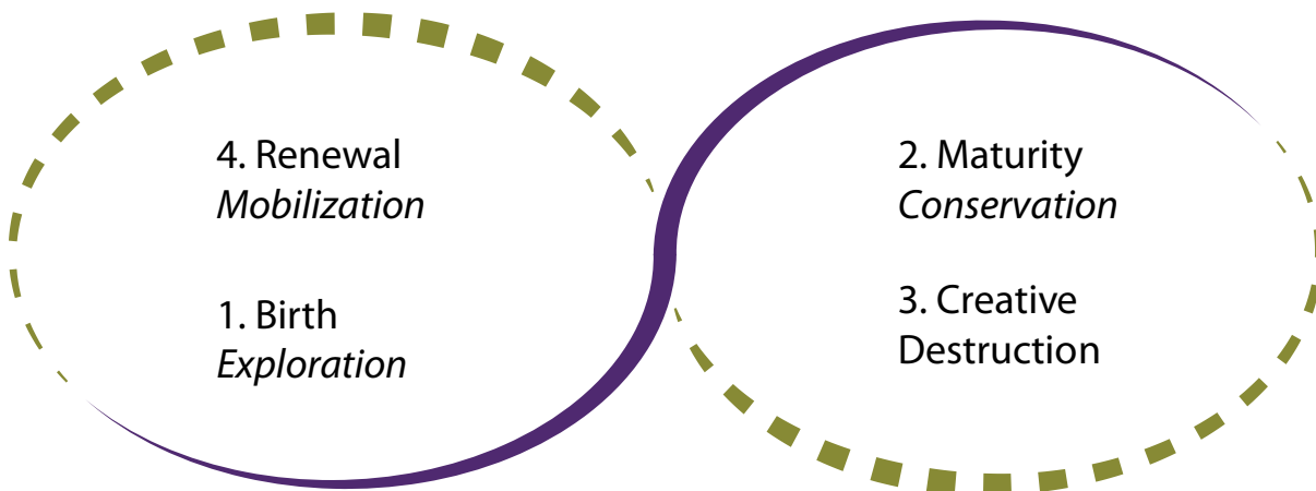
Figure #1 “Adaptive Cycles” created by C.S. Holling and a team of associates, 2002

The Adaptive Cycle is communicated through a natural systems metaphor. Organizational change dynamics are categorized in the four phases of an eco-cycle: Birth (exploitation), Maturity (conservation), Creative Destruction and Renewal (mobilization). The Birth to Maturity cycle, described as the “front loop,” depicts the traditional projection of ongoing growth and development of popular management thinking. The Creative Destruction and Renewal Phases of the cycle are referred to as the “back-loop” (indicated by a perforated line in Figure #1).