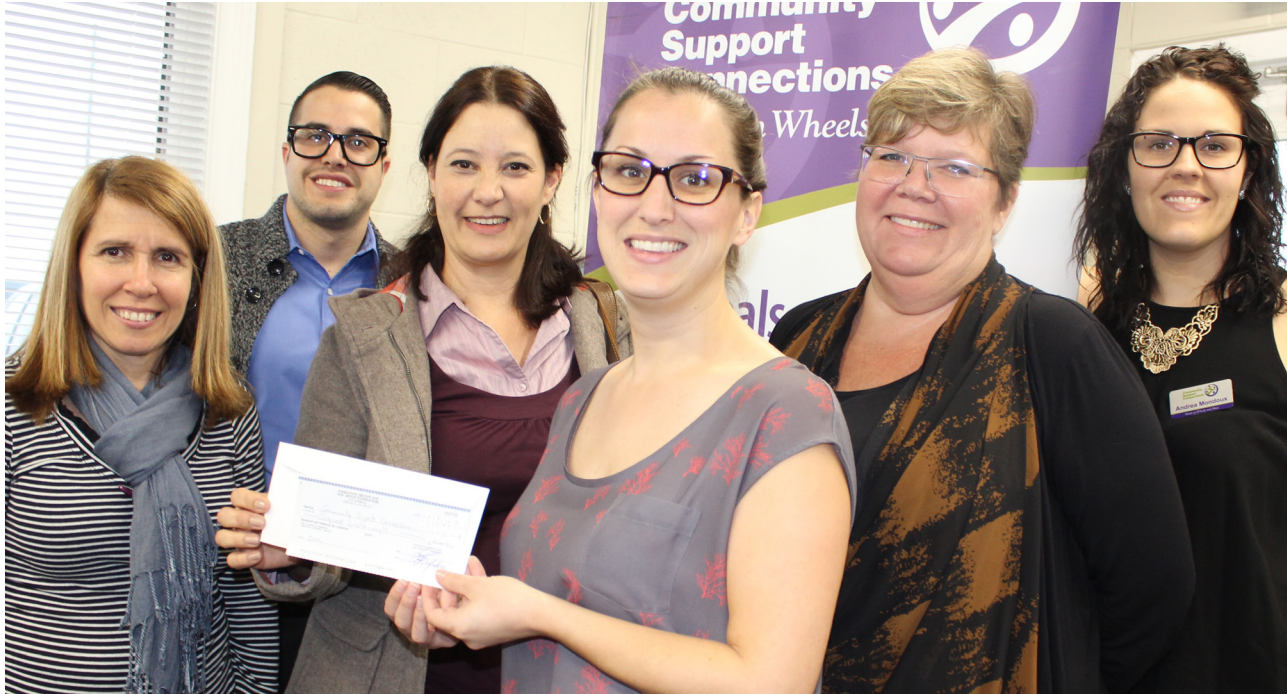
AGF - Rebar Inc cheque presentation at Meals on Wheels on Us Donor Lunch

$101,790 subsidized 23,680 meals and 1,717 rides, supporting our most vulnerable clients