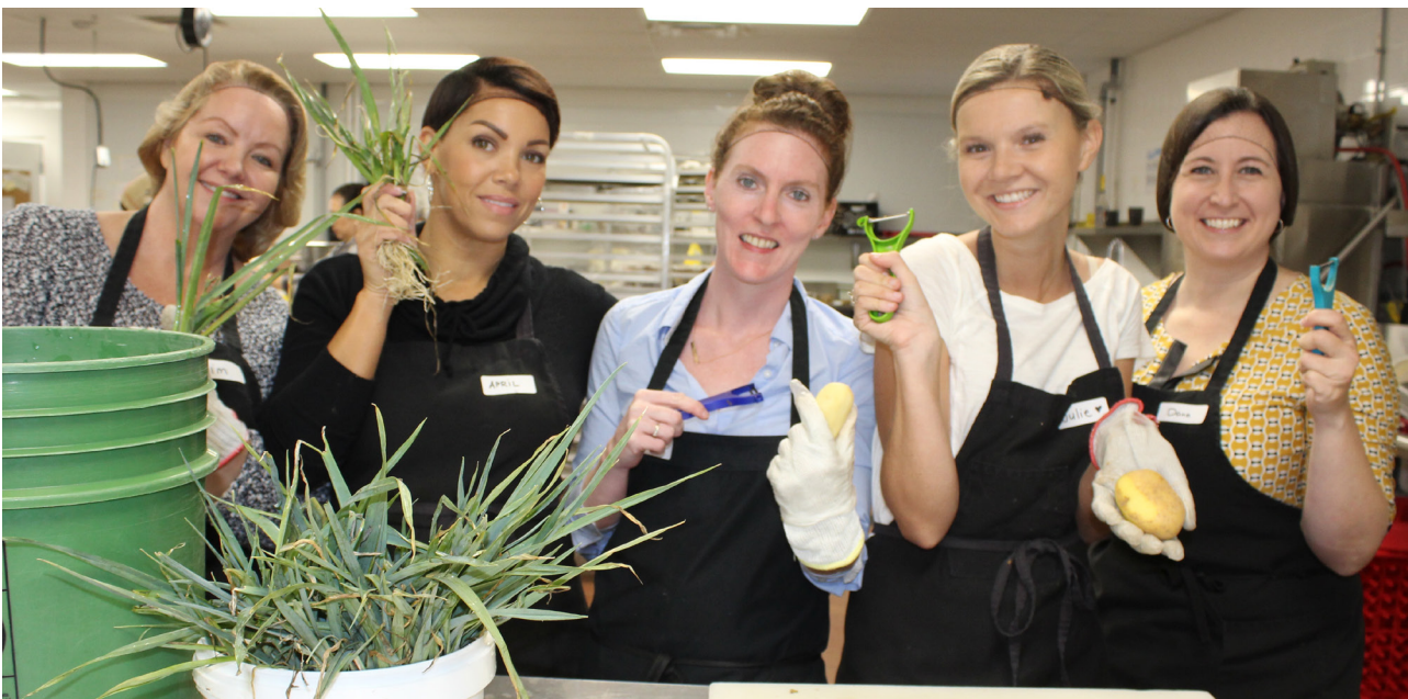
WWLHIN staff volunteering in the Tender Loving Care Kitchen