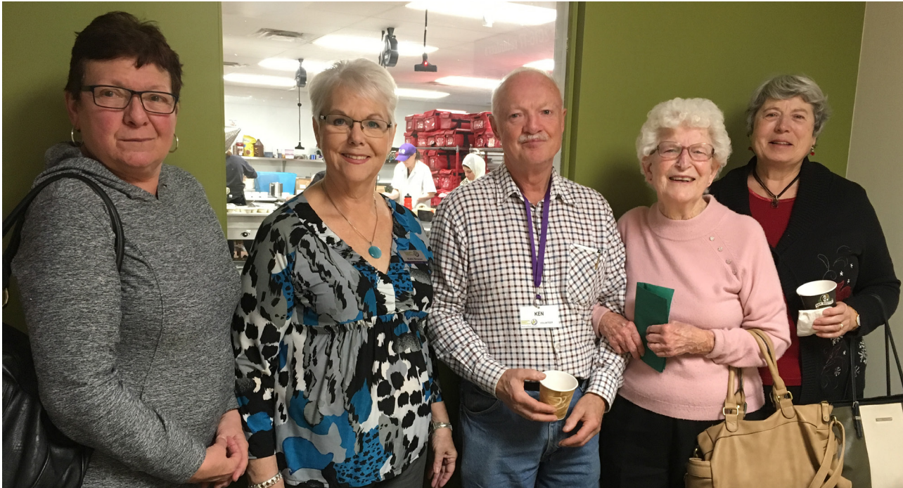
Donors touring CSC offices in November during our Donor Open House